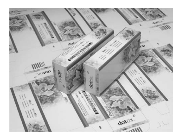
Figure 2. Digital printed package, containing watermark

When the factory is printing the design, the security information contained in the digital watermark is printed at the same time. This makes it quite cost-effective to produce a protected package: there are no extra production stages required.